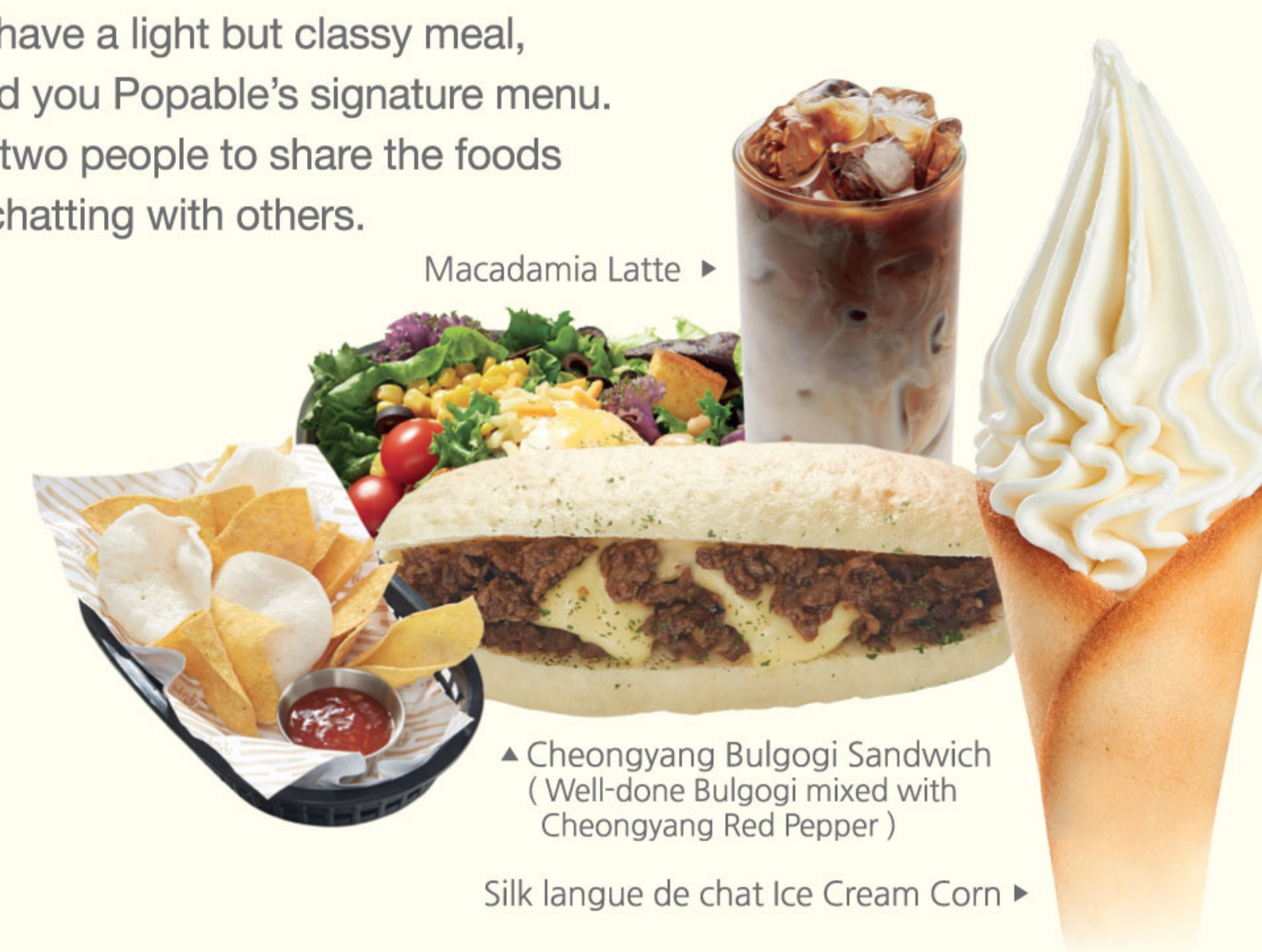
Macadamia Latte ▶

If you want to have a light but classy meal, we recommend you Popable's signature menu. It's perfect for two people to share the foods and have fun chatting with others.